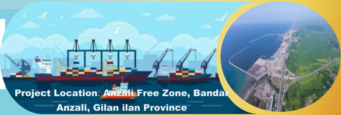
Project Location: Anzali Free Zone, Bandar Anzali, Gilan ilan Province